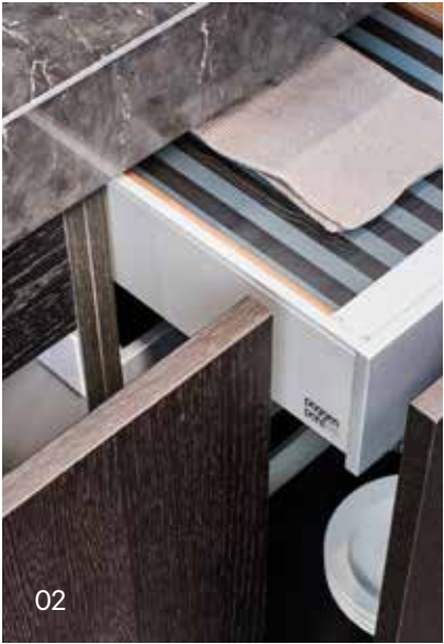
01_ Massive stone in combination with wood and fine light strip. 02_ Lots of room due to excellent use of space. 03_ Hinges without visible screws allow for perfect door alignment.