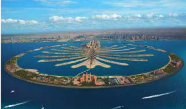
THE PALM JUMEIRAH