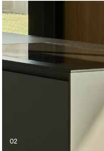
01_ More room inside thanks to drawer guides below the drawer. 02_ Grip cavity as visual separators. 03_ In-built devices at working height.