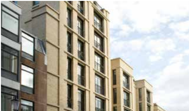
21 YOUNG STREET