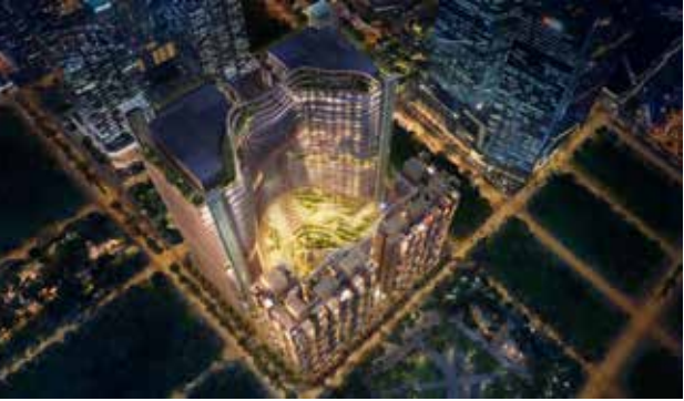
MARINA ONE RESIDENCES