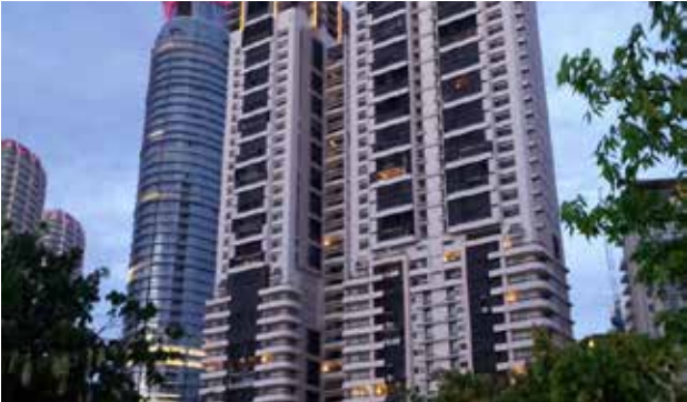
THE BINJAI ON THE PARK