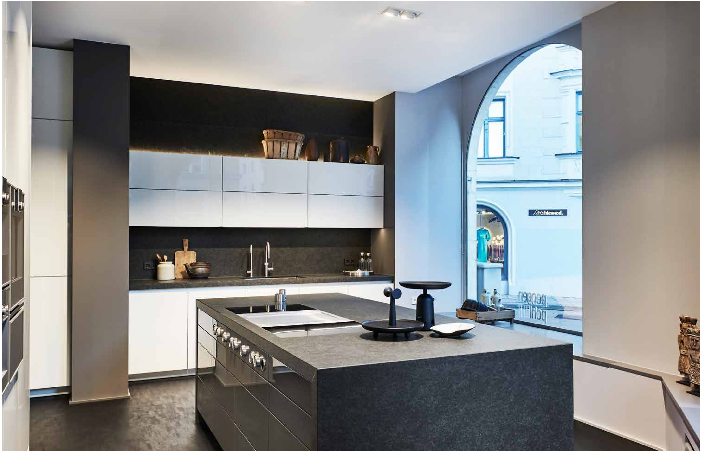
Kitchen block with filigree cabinet lines.

The Premium Collection has the right thing for every room.