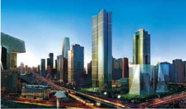
BEIJING FORTUNE CENTER