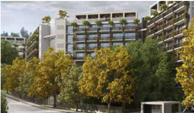
EDIFICIO PARQUE ARBOLEDA LO CURRO