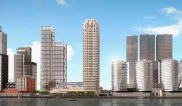
NEW ORLEANS TOWER