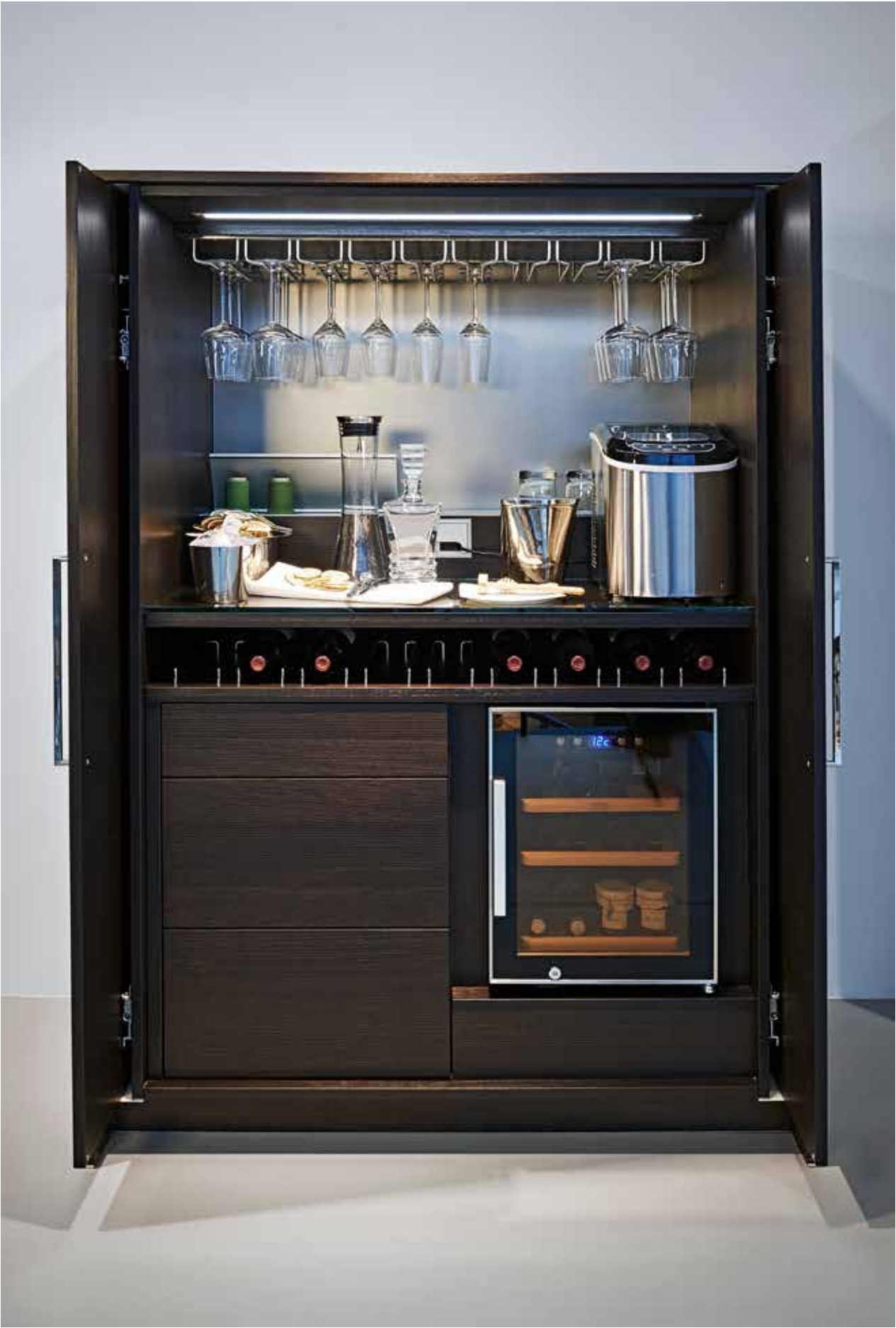
Dark wood, matching inlays, a wine rack and a preparing top. Perfect conditions for a stylish house bar.

The pocket doors slide into the side walls and so achieve maximum opening width.