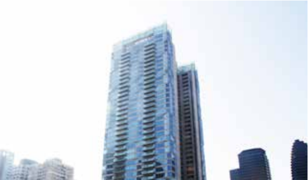
MAPLE GARDEN TOWER