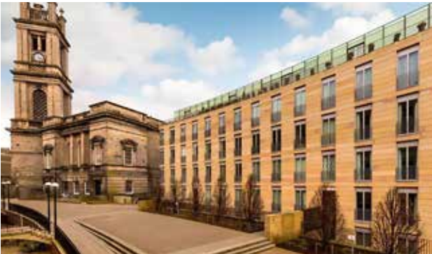
ST. VINCENT PLACE