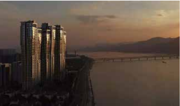
HANGZHOU GINKGO ART MANSION