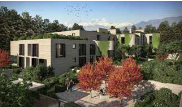
SAN JOSE DELLA SIERRA