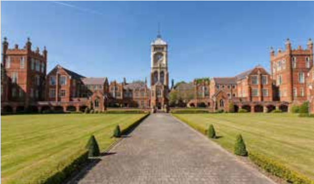
ROYAL CONNAUGHT PARK