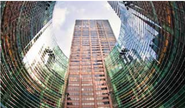
ONE BEACON COURT